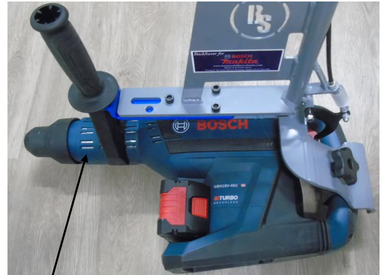
Makita®/Bosch® Forward Handle

For the Bosch Drill GBH18V-40C you will need to adjust the metal band to sit as close to the body of the drill as possible. See photos on pg 8 for illustration.