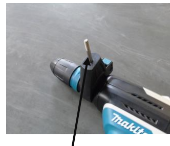
Foam allows for bolt to stay in place.