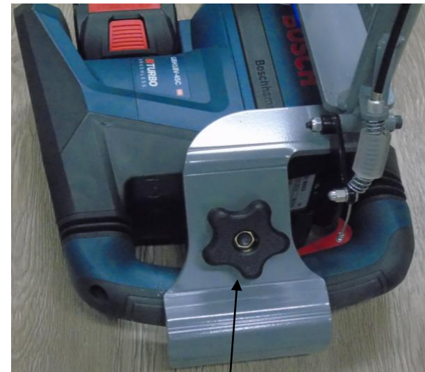
Handle Clamp Knob