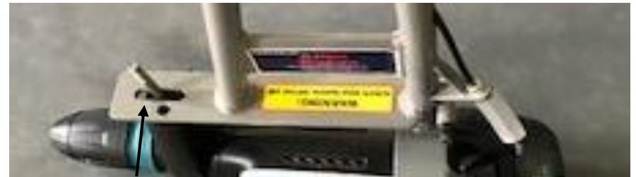
HR4041C, HR4013C, HR4002, and Battery-Operated Makita®