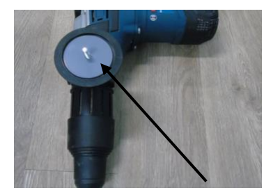
BackSaver Supplied Washer (For Bosch® Models Only)