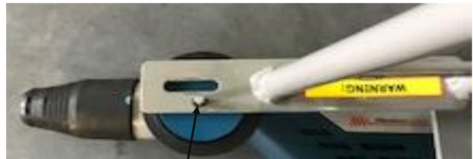
Bosch® models 540M, 540S, 11264SDS and 11265Spline