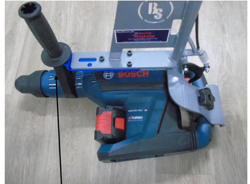
Makita®/Bosch® Forward Handle

*Do NOT tighten the handle until the end of Step 7